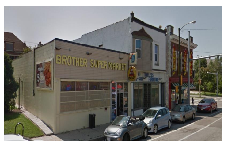
L & A Food Market: image capture Aug 2017@2018 google U.S