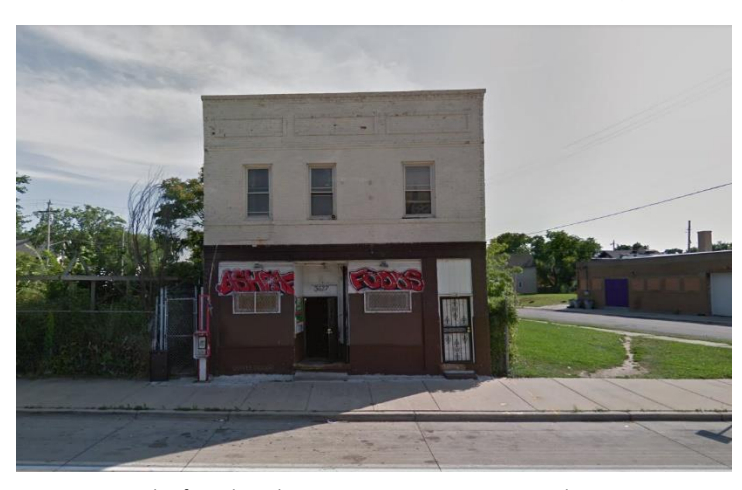
Ashraf Food Market: image Aug 2017@2018 google U.S