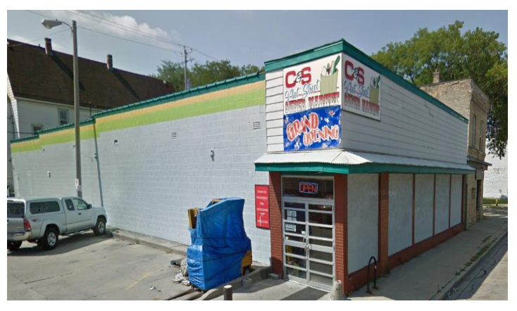
C & S Vliet Supermarket: image capture Aug 2017@2018 google U.S